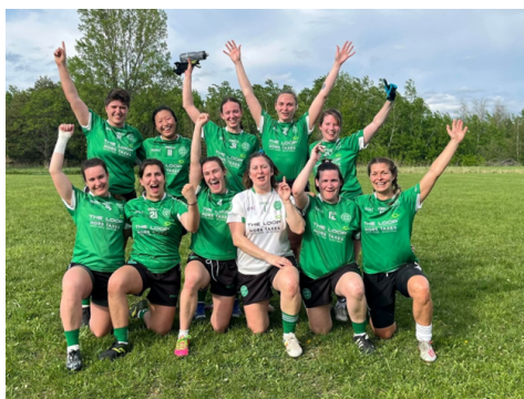
Montreal May Tournament Ladies Senior Champions