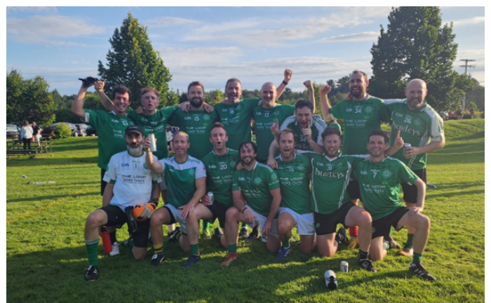
Eastern Canadian Mens Senior Champions