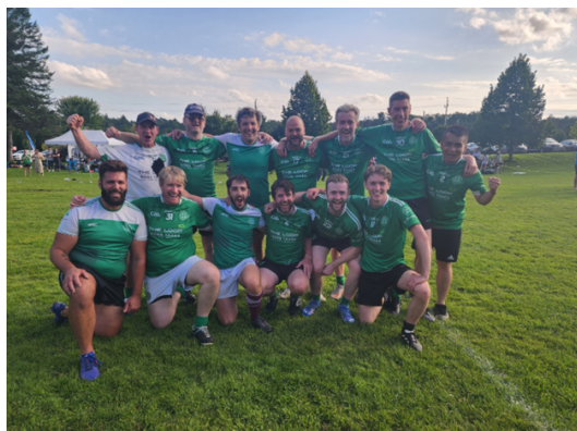
Eastern Canadian Mens Junior Champions