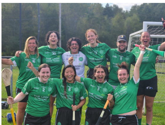
Eastern Canadian Camogie Champions

at the Owenbeg GAA centre of excellence in County Derry, Northern Ireland. The Montreal Shamrocks are extremely proud to have sent over 40 players to Ireland, participating in all 4 codes, the largest player representation from a single club in the world. The players played in teams selected from Eastern Canadian clubs and represented either Quebec (Montreal and Quebec) or Eastern Canada (Montreal, Quebec, Ottawa, Halifax) at the tournament.