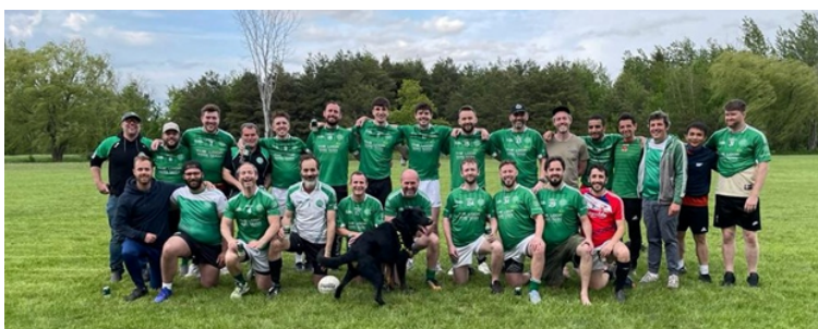
Montreal May Tournament Mens Senior Champions

The Eastern Canadian Championships were hosted by the Quebec Patriotes Gaelic Athletic Club and took place at the sports grounds in Pont Rouge, Quebec, on labour weekend 2023. Teams and participants from Peterborough, Kingston, Ottawa, Quebec City, Halifax, Calgary and Montreal competed for titles in all four codes, mens and ladies gaelic football, hurling and camogie. The ladies senior and junior football and hurling teams reached finals in their respective competitions but were unlucky on the day. The mens gaelic football senior and junior teams were both victorious, the junior team beating old rivals, Ottawa Gaels, in a memorable match which was forced into extra time. The Shamrocks Camogie team were also victorious claiming the title of Eastern Canadian Champions to round out a remarkable year for Shamrocks Camogie.