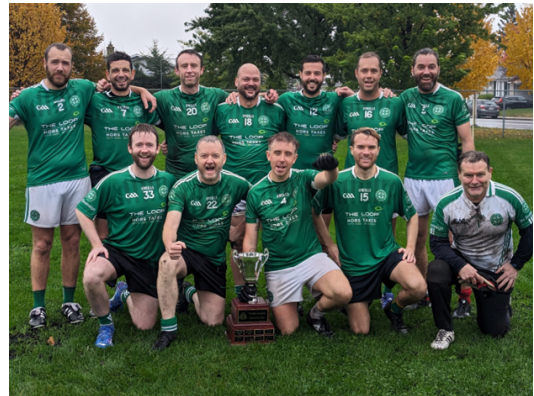
Quebec Championship Champions