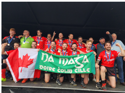
World GAA Hurling Champions

years in the wilderness to claim the trophy. Camogie champions were N.D.G Na Fianna Rouge with the Pointe-Saint-Charles Cú Chulainn claiming the Hurling title.