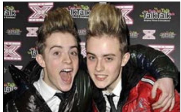
John and Edward Grimes (aka "Jedward")